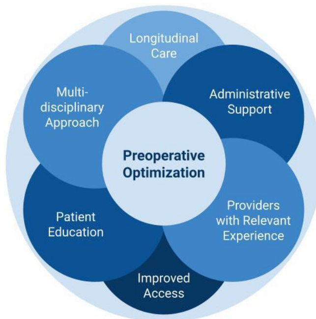
Figure 2 Model of desired elements of a preoperative optimization process for opioid exposed patients.

Multiple providers suggested streamlining perioperative opioid management with a clear pathway. In anesthesia, participants recommended a perioperative pain clinic staffed with a team whose specific role would be to follow patients both preoperatively and postoperatively. When describing this perioperative clinic, anesthesia providers placed value on administrative and nurse staffing support. Similarly, a primary care provider described the need for a robust pain management clinic staffed with providers trained in the complex management OUD and chronic pain. Three surgeons cited needs specific to patient screening. They recommended a systematic preoperative screening process that does not rely on surgeons, identifies patients with low pain thresholds and provides clarity on specific thresholds warranting preoperative inpatient treatment to taper or stabilize opioids. Multiple providers expressed that while a screening tool may be helpful in identifying patients at risk, the question of how to manage these patients would remain a challenge. Four participants noted needs related to clarifying and standardizing pain management, such as clarity about who to contact, standardized protocols for peri-operative pain management, and standard and dedicated post-operative pain management supports and services. The need for ideal practices to be standardized is exemplified by the quote: